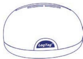
LTI-HID Not Included