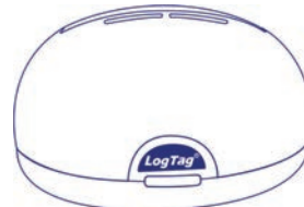
LTI-WiFi Not Included