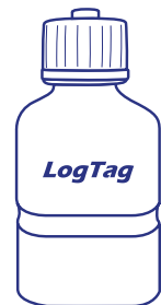
Glycol Buffer Not Included