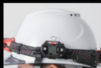
Mounted to helmet band * Attached to belt clip