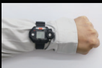
Attached to wrist (wristwatch type) *Attached to watch band