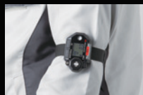
Worn on arm (band type) * Attached to arm band