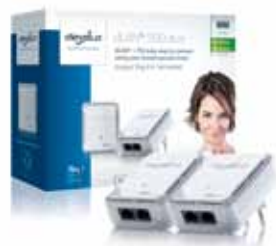
dLAN® 500 duo Starter Kit