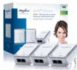
dLAN® 500 duo Network Kit