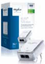
dLAN® 500 duo

Two Fast Ethernet LAN connections—use the second LAN port to connect another device simultaneously.