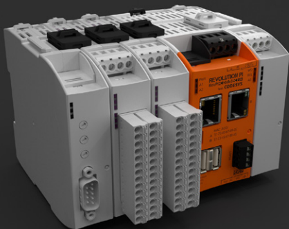
Easy connection of expansion modules via plug-and-play

The RevPi Connect+ feat. CODESYS can be used as a powerful, industrial small controller for a variety of different automation tasks and represents a real alternative to complex and cost-intensive PLCs.