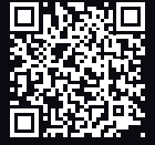
RUTX10 360° VIEW