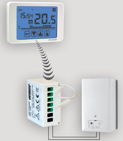
Example of connection with 1 channel remote actuator