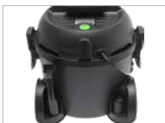
FOOT-ACTIVATED ON/OFF SWITCH ON-BOARD TOOLS STORAGE