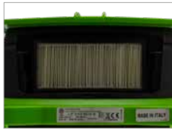
POLY CARTRIDGE DOWNSTREAM