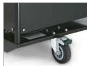
COVER AND TROLLEY IN PAINTED SHEET METAL