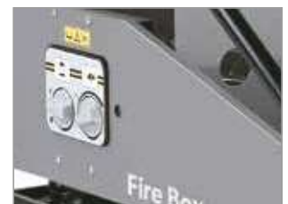
ELECTRIC CONTROL PANEL WITH ON-OFF SWITCH AND THERMOSTAT