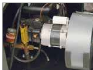
SINGLE PHASE BURNER MOTOR CONNECTED TO FAN AND DIESEL FUEL PUMP