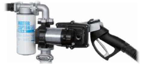
EX50 DRUM WITH MANUAL NOZZLE

OUR PUMPS COMPLIES WITH THE FOLLOWING MARKING ATEX/IECEx