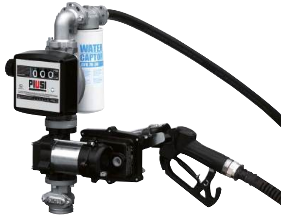
PIUSI EX50 DRUM WITH METER AND FILTER

The PIUSI EX50 DRUM is a complete pump transfer kit expressly engineered for ATEX/IECEx areas. This system is composed of a high-efficiency pump, manual or automatic nozzle and a telescopic suction hose. Thanks to the flanged components, this transfer set allows users to replace any component without using sealants thus creating maximum versatility and adaptability to any kind of condition. K33 mechanical meter available on request.