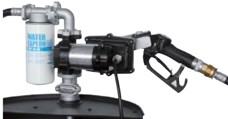
EX50 DRUM WITH AUTOMATIC NOZZLE