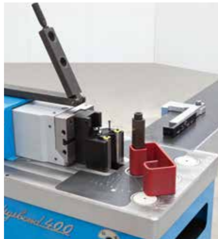
Bending tool with pin \varnothing 50 mm, H=200 mm, revolving pin single V die and antileflection bar. max. 200 x 8 mm. Patent Pending.