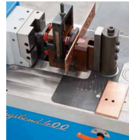
Punching unit for holes up to \varnothing 30 mm. Max thickness 12 mm.