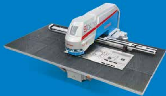
sheet metal working center