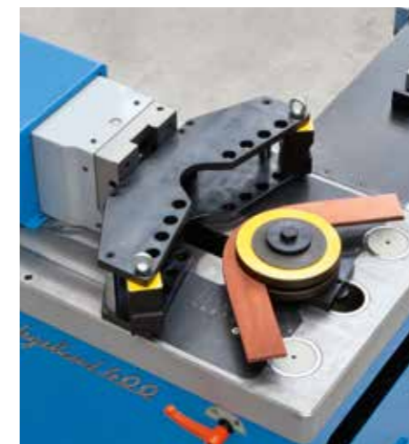
2 jaw bending tool with set of flanges for flat and shaped bars up to 90°. Max 60 x 20 mm.