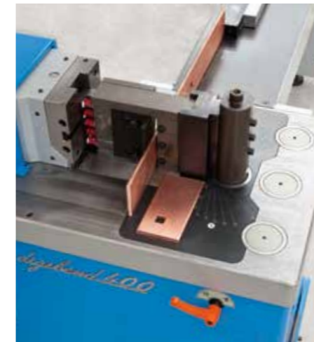
Shearing unit for flat bars. Max 150 x 12 mm.