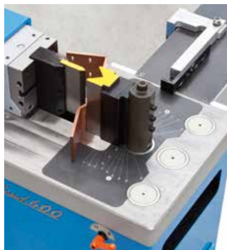
Movable bending punch and fixed die for tight bends.