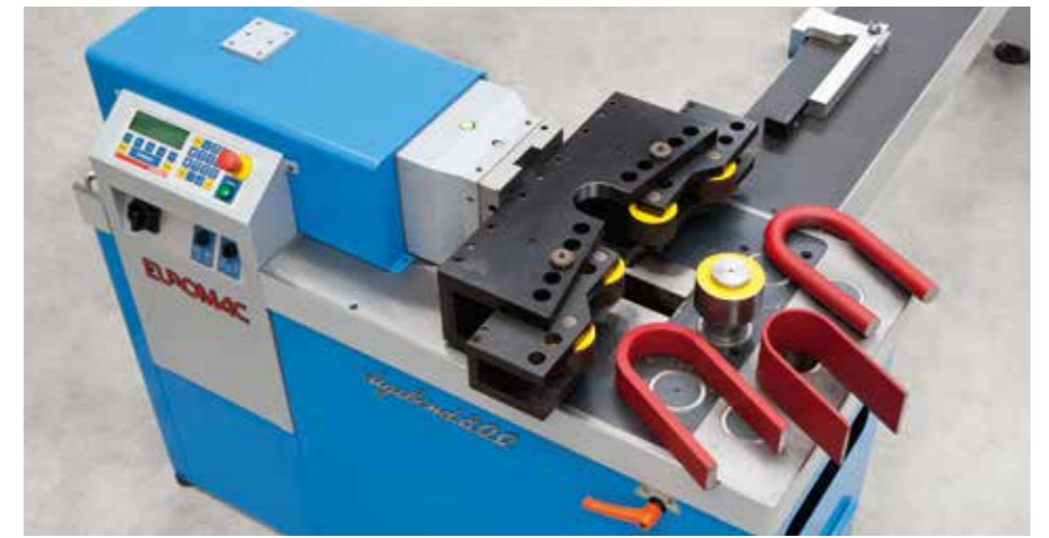
4 jaw bending tool for round, square, rect. Bars and thick pipes up to 180°. Max 100 x 20 mm or \varnothing 50 mm.

The flexible and strong design of the Digibend table (with antimarking treatment) together with the easy to use control system ( 2 axis CNC controlled ) allows any customer to create their own custom tools for special applications.