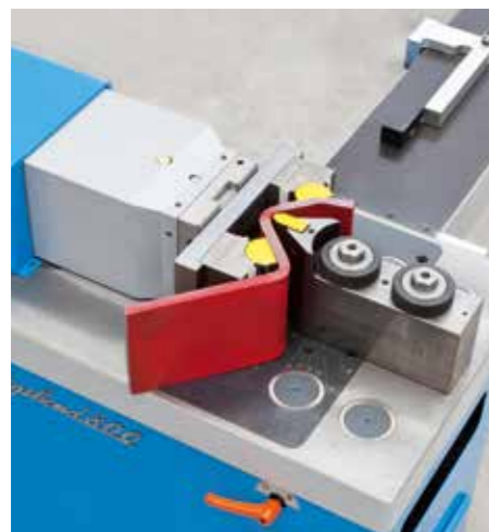
Tool single V die with revolving pin (mark-free bending) for thick plates. Max 200 x 40 mm.