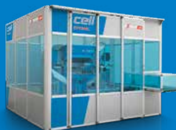
automated electric press brake