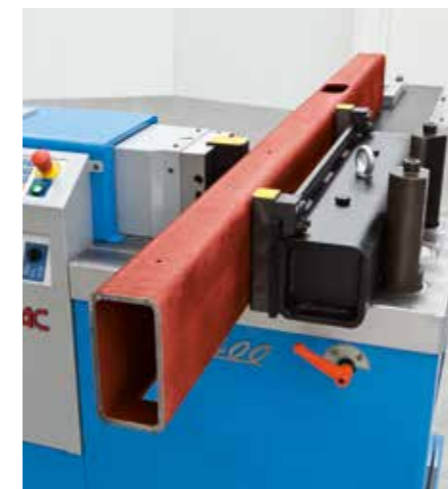
Straightening tool for pipes, steel beams, flat bars etc. for precision and heavy straightening jobs.