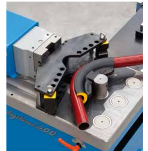
2 jaw bending tool for thick wall pipes from 3/8" gas (17.2 mm) up to 2" gas (60.3 mm) and round bars, up to 90°.