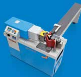
horizontal bending machines