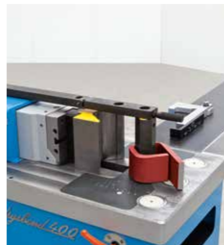
Pin bending punch \varnothing 80 mm with antileflection bar for bending a closed loop into thick wall bars. Max 200 x 15 mm.