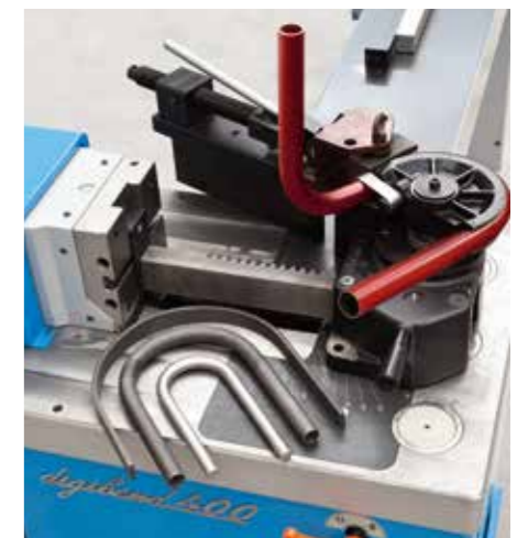
Rotary bending tool for pipes, round and box tube, up to 180°. max \varnothing 50 mm.