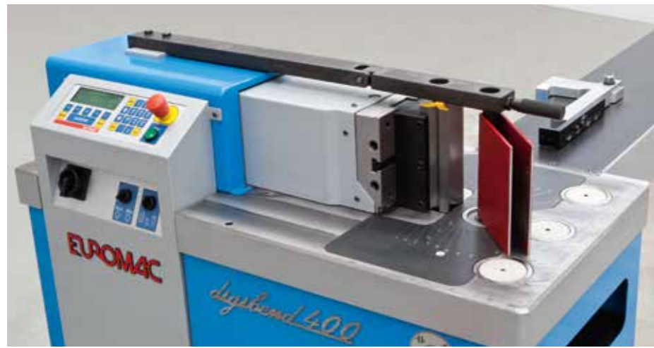
Bending tool with pin \varnothing 30 mm, H=200 mm and antileflection bar. Max 200 x 5 mm.

With Euromac you get the maximum bending flexibility