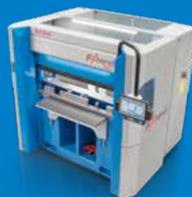
electric press brake