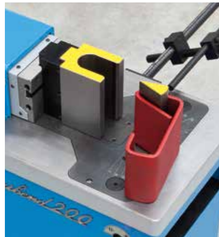
Bending tool 30° with U shaped die for bending flat bars up to 30°. Max. 16 x 200 mm.