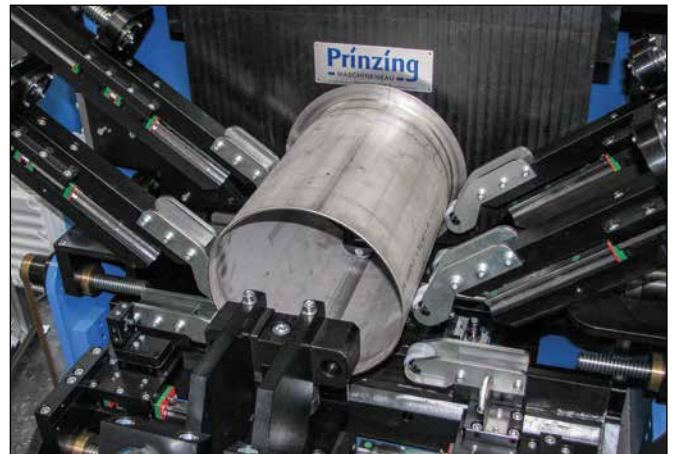
Machining of cylindrical tubes