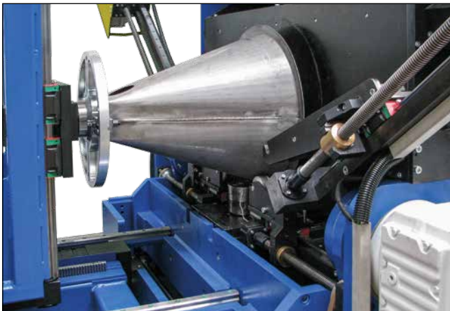
Machining of conical tubes