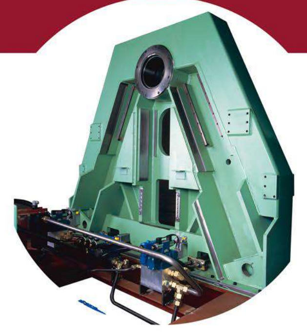
PAS 500 during assembly

The high drive torque makes it possible to prebend with maximum capacity and to bend a plate with maximum plate thickness down to a small radius in only one pass. All ROUNDO 4-roll plate bending machines have precise control of the speed difference between top roll and lower roll.