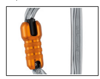
The sleeve is reinforced for greater front and lateral gate strength.

The Bm'D lightweight asymmetrical carabiner is made of aluminum. It has a D shape particularly suited for connection to diverse equipment such as descenders or positioning lanyards. Its fluid interior design and Keylock system facilitate handling. The Bm'D carabiner has the TRIACT-LOCK automatic locking system. The sleeve is reinforced for greater front and lateral gate strength. Bm'D may be used with a CAPTIV positioning bar to favor loading of the carabiner along the major axis, to limit the risk of it flipping and to keep it integrated with the device.