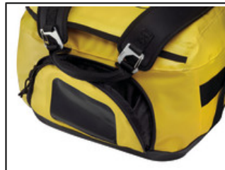
Large side pocket with zipper closure to separate the helmet, shoes, or other objects from the rest of the equipment.