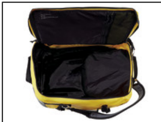
Large D-shaped opening for easy equipment organization.

Designed to be carried in multiple ways, DUFFEL 65 is a convenient, ergonomic bag with a volume of 65 liters. The back and shoulder straps are padded for comfort when used as a backpack. Versatile, it can be carried in multiple ways with removable shoulder straps. The large opening allows easy access to equipment, including two pockets in the inner flap and a large side pocket for a helmet or shoes. A large transparent area allows rapid identification of the bag. It is constructed of high-strength TPU tarp material for intensive use.