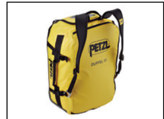
Padded, adjustable back and shoulder straps for comfortable carrying.