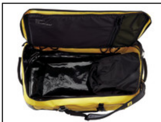
Large D-shaped opening for easy equipment organization.

Designed to be carried in multiple ways, DUFFEL 85 is a convenient, ergonomic bag with a volume of 85 liters. The back and shoulder straps are padded for comfort when used as a backpack. Versatile, it can be carried in multiple ways with removable shoulder straps. The large opening allows easy access to equipment, including two pockets in the inner flap and a large side pocket for a helmet or shoes. A large transparent area allows rapid identification of the bag. It is constructed of high-strength TPU tarp material for intensive use.