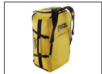
Padded, adjustable back and shoulder straps for comfortable carrying.