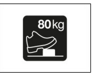
Excellent resistance to falls, to impacts and to crushing.