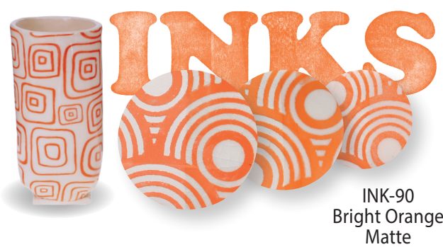
INK-90 Bright Orange Matte