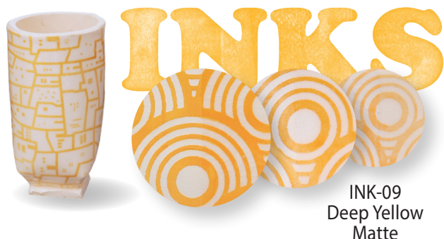
INK-09 Deep Yellow Matte