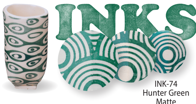
INK-74 Hunter Green Matte