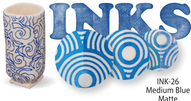
INK-26 Medium Blue Matte