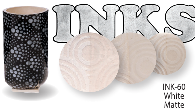
INK-60 White Matte