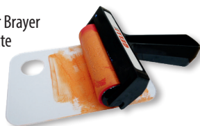
Rubber Brayer & Palette

Many printmaking processes can be replicated by changing the printing ink to AMACO Ceramic Printing Ink and the paper to slabs of clay. The same equipment can be used: brayers etc.