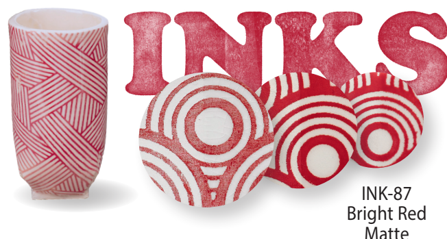
INK-87 Bright Red Matte