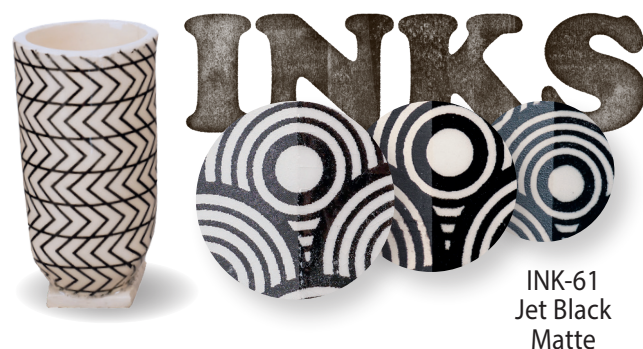
INK-61 Jet Black Matte