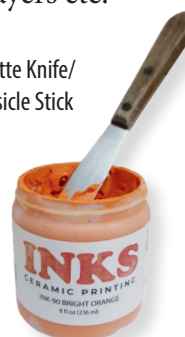
Palette Knife/ Popsicle Stick

Share your Inks techniques with us on socials!