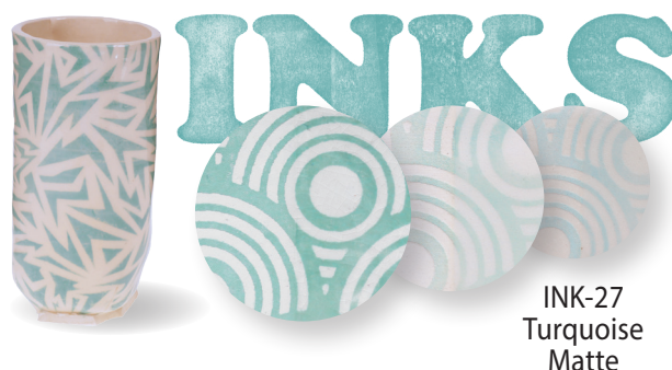
INK-27 Turquoise Matte