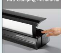
Built-In Tool Box for remote control and power cord