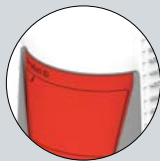
Content identifying system