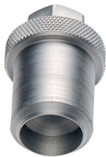
# 603 336-1 Drill-sleeve