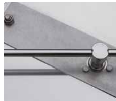
precision rotor arm