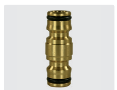
Brass. 16 mm (1/2")