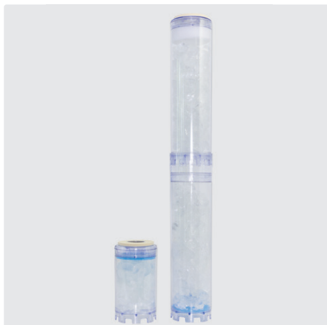
Water softener. Polyphosphate