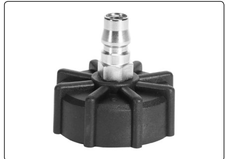
Straight Adaptor - Model No. VS820SA.