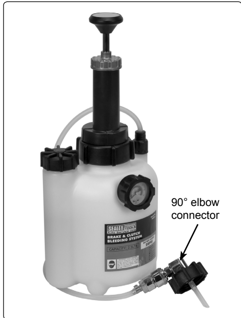
90° elbow connector