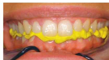
Complete colour change (yellow)