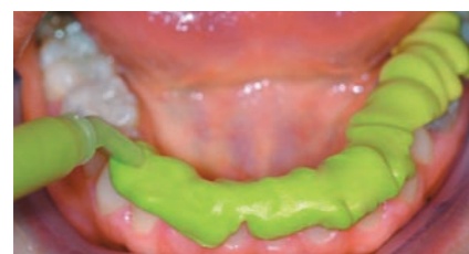
Application of COLORBITE D (green)

Extra rigid, thermochromic A-silicone with fast set. COLORBITE D is green at room temperature and becomes yellow at 35°C in the mouth to indicate that setting is complete.