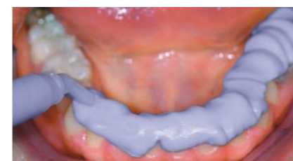
Application of COLORBITE ROCK (purple)

Rigid, thermochromic A-silicone with extra fast set. COLORBITE ROCK is purple at room temperature and becomes pink at 35°C in the mouth to indicate that setting is complete.