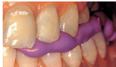
Bite registration (second phase)