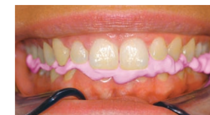
Complete colour change (pink)