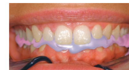
Setting phase (colour change from purple to pink)