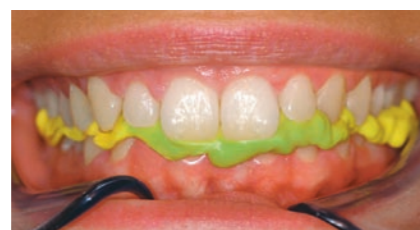
Setting phase (colour change from green to yellow)