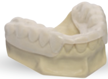
Occlusal splint made of Drufosoft® pro