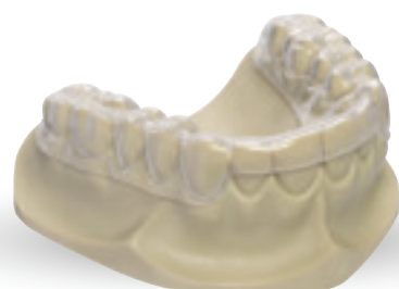
Occlusal splint made of Kombiplast