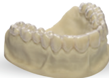
Aligner made of Biolon