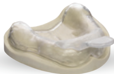
Transparent individual tray made of Drufoplast