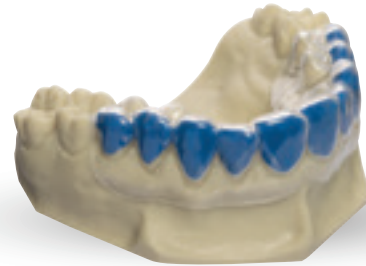
Bleaching/Medicament splint made of BioBleach® soft. Drufolen W used as a spacer