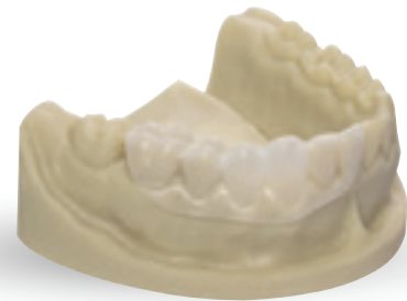
Template for the production of provisorials made of Drufolen H