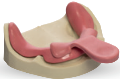
Individual tray made of Drufoplast