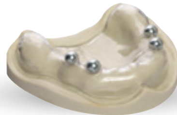
X-ray splint made of Biolit D