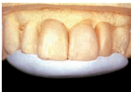
Matrix for use in making temporary crowns/bridges