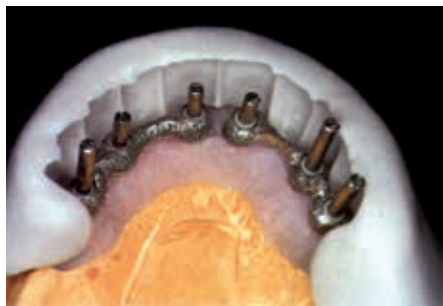
Control matrix for the design of implant structures