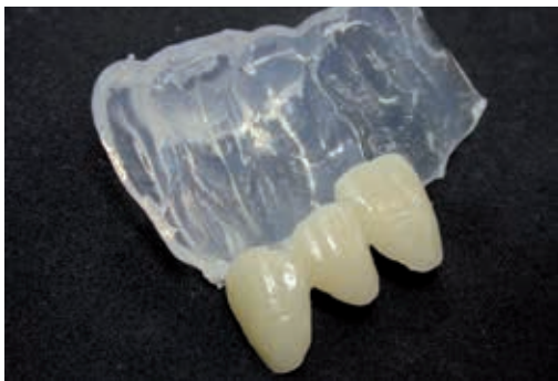
Ideal rigidity to produce composite without deformations