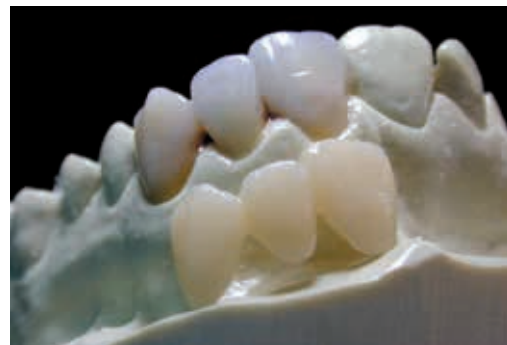
Final result: does not effect the working properties of light-curing composites