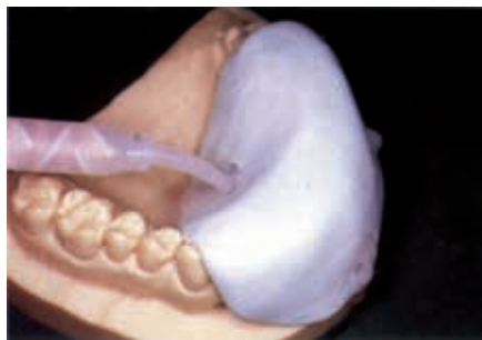
ZETALABOR matrix for tissue replication with injection holes using Zhermack Gingifast Elastic