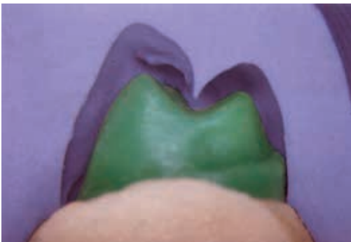
Control matrix for the design of the metal structure