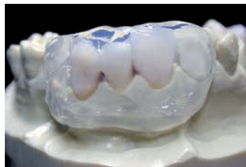
High degree of transparency