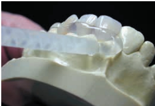
ELITE TRANSPARENT high fluidity during application