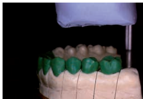
Ceramics technique printed on the verticulator