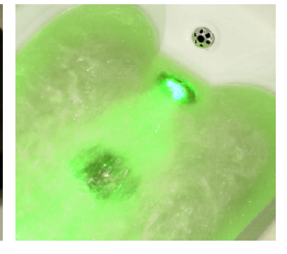
Extensible shower for rinsing Drainage of basin