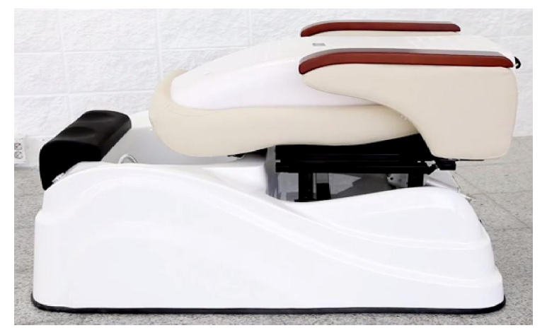
*These images slightly differ from the final product.