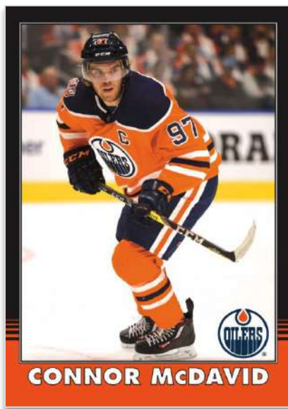
BASE SET – RETRO VARIATION