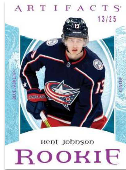
ROOKIES Purple Parallel