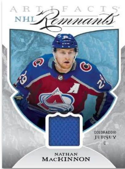
NHL® REMNANTS Jersey