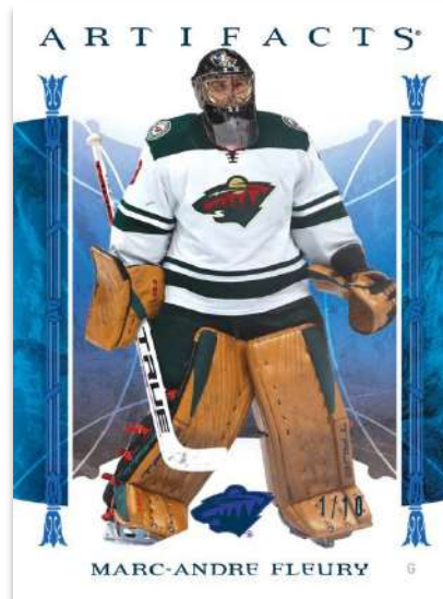
STARS/GOALIES/LEGENDS Spectrum Jungle Parallel