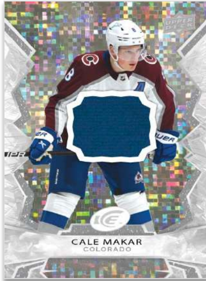
BASE SET Jersey Parallel