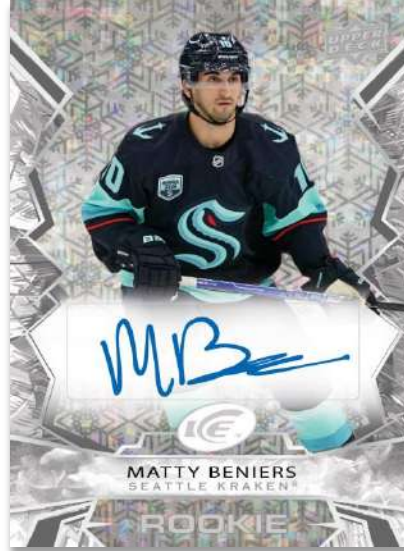
BASE SET ROOKIES White Snowflake Auto Parallel