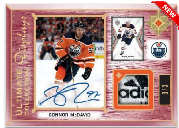
ULTIMATE DISPLAYS Auto Tag – Tier 2

New Additions! This latest edition of Ultimate Collection includes five new and incredible inserts: