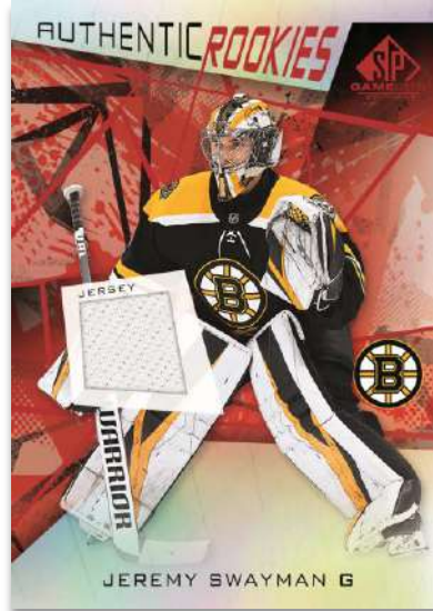
AUTHENTIC ROOKIES Jersey Parallel