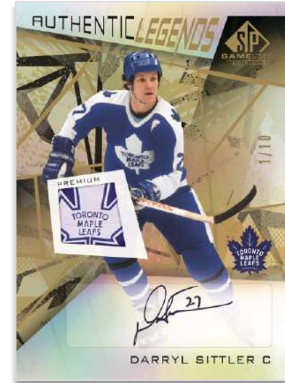
AUTHENTIC LEGENDS Autograph Premium Memorabilia Parallel

2021-22 SP Game Used Hockey sports a 200-card base set consisting of star veterans, legends and rookies. The set breaks down as follows (subject to change):