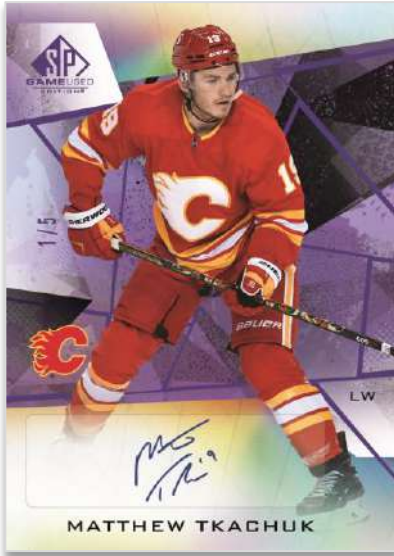
BASE SET Purple Fragment Auto Parallel