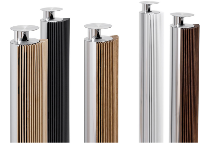
BeoLab 18 Experience a statement of outstanding craftsmanship and breathtaking sound.

BeoLab 18 is designed for smooth interoperability. Connect it to a recent BeoVision 11 for the ultimate wireless surround sound setup, or add the BeoLab Transmitter 1 to any TV or music system – Bang & Olufsen or not – to connect. All WiSA-compliant products are able to communicate seamlessly with each other, out of the box.