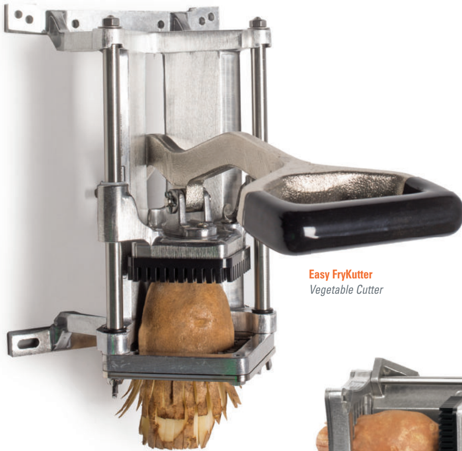
Easy FryKutter Vegetable Cutter

Choose Easy FryKutter for labor savings and improved productivity. Or power through the biggest spuds at lightning speed with the one and only Monster FryKutter.