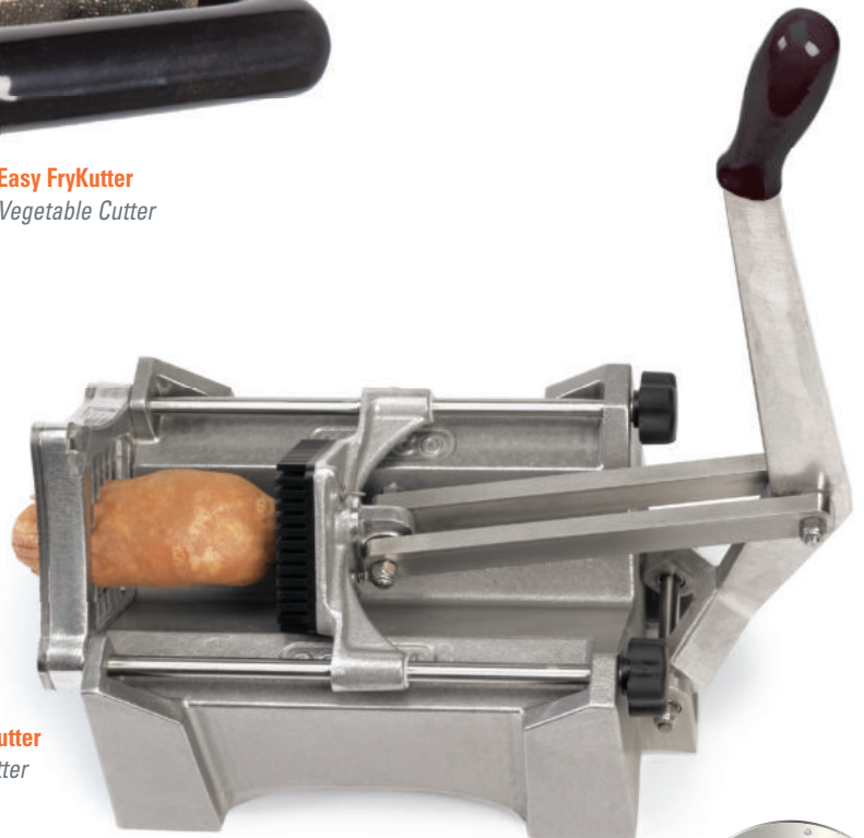
Monster FryKutter Vegetable Cutter

Buy once. Buy the original. Always look for this mark of quality