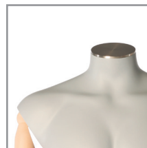
Option: Neck plate metal Male: CAP M02 Female: CAP F02