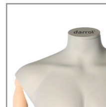
Option: Logo plate, please contact Retailment regarding this option