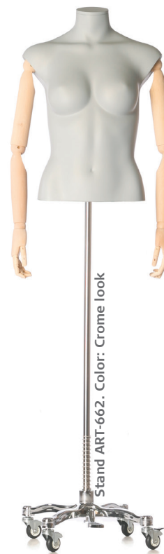
ART-792 Height 162 cm Chest 88 cm Waist 66 cm