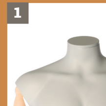
The headless mannequin