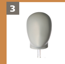
Replace the neck plate with your choice of head