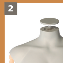
Simply remove the neck plate