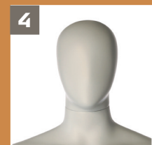
All done - you got a man- nequin with head