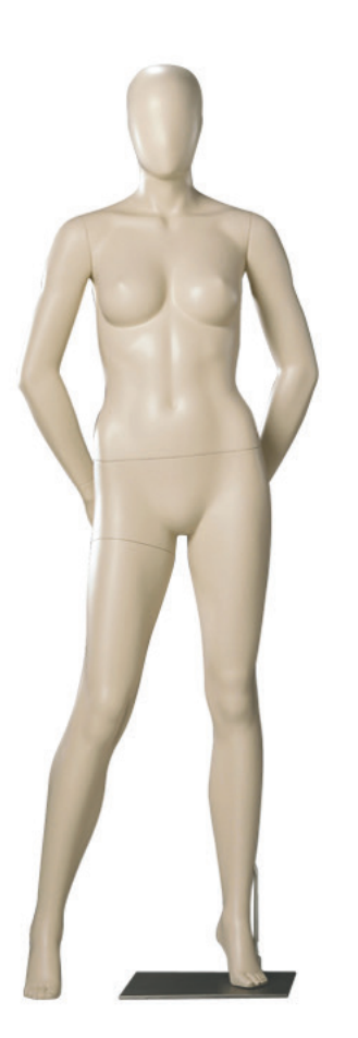
| ART-930 | Height | 179 cm | Chest | 88 cm | Waist | 65 cm | Hip | 86 cm | Inside leg | 82 cm | Heel height | 8 cm | Shoe size | 39