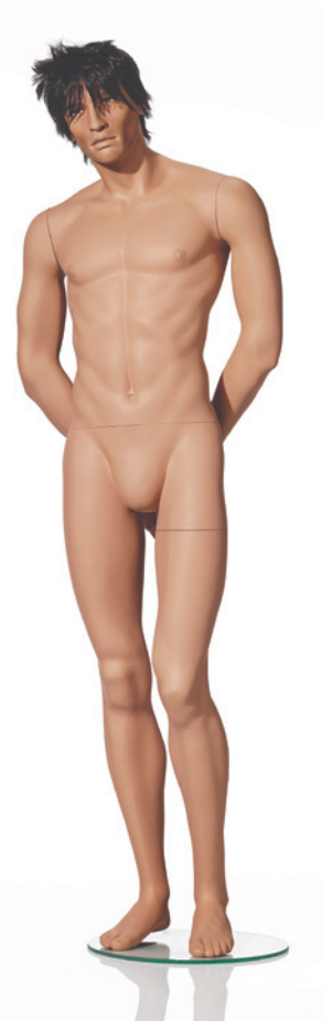
| 501002 Noah/1