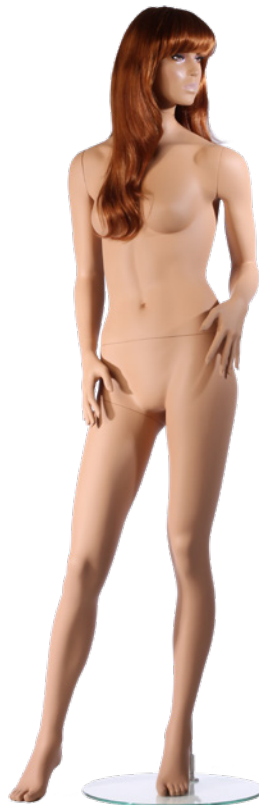
| 101008 Sue/1