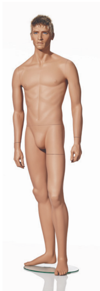
| 501007 Noah/1