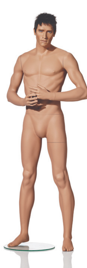
| 501003 Noah/1