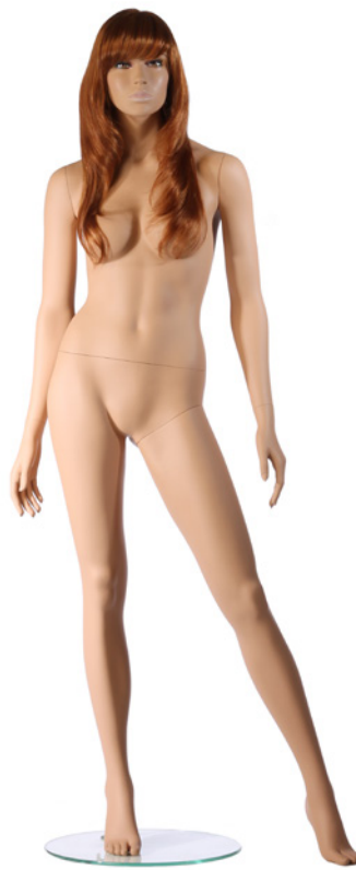
| 101007 Sue/1