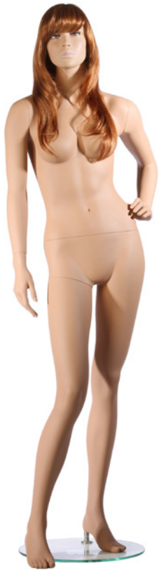
| 101004 Sue/1