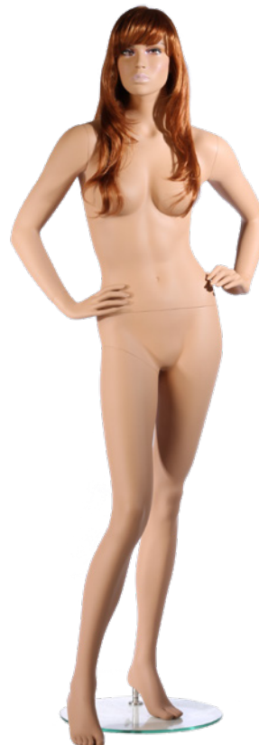
| 101003 Sue/1