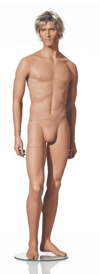
| 501006 Noah/1