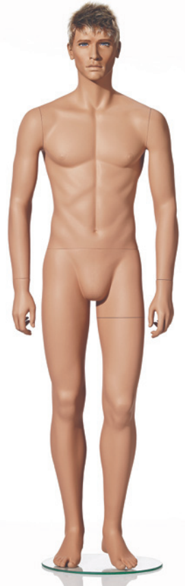
| 501001 Noah/1