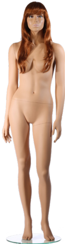
| 101002 Sue/1