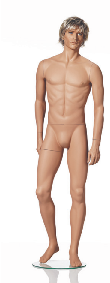
| 501005 Noah/1