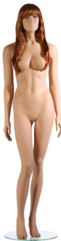
| 101001 Sue/1