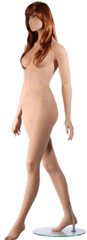
| 101010 Sue/1