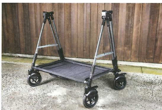
Step 4: Fold out transport base