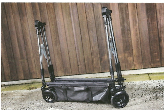
Step 3: Unfold the other side