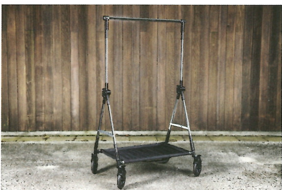
Step 5: Fold up the hanging rail