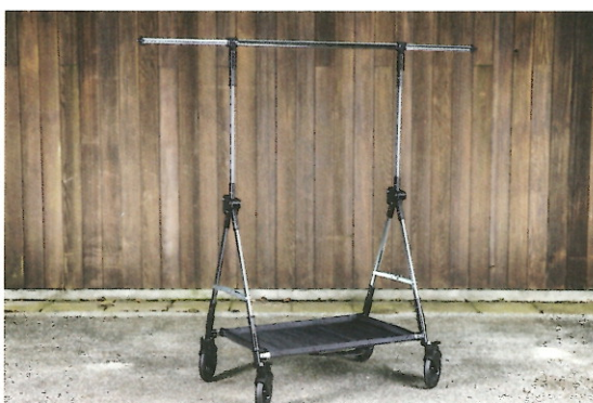
Step 6: Extract the rails