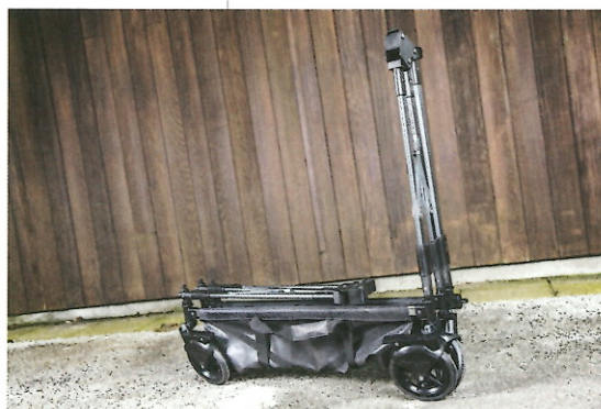
Step 2: Start unfolding