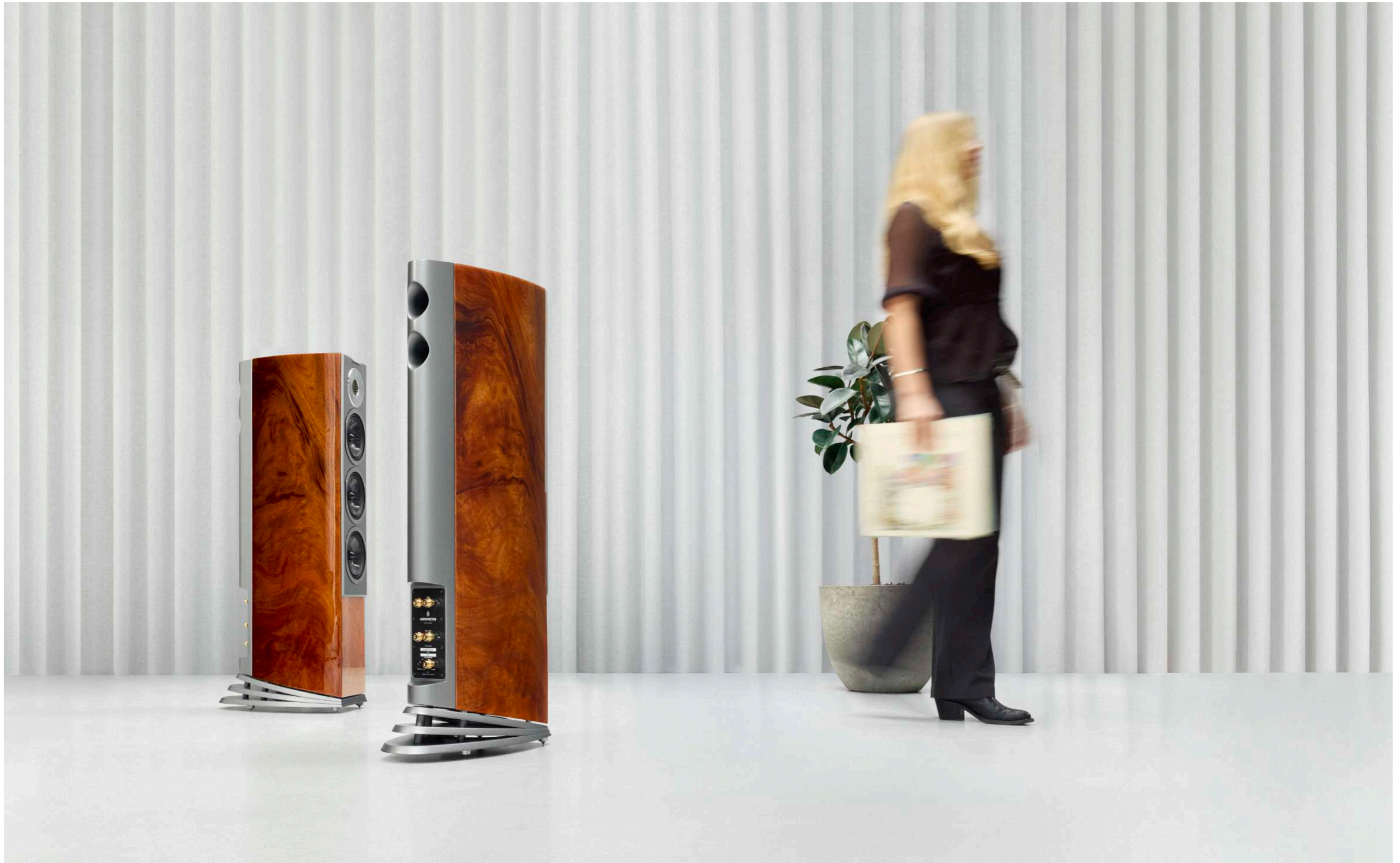
R 5 in African Mahogany