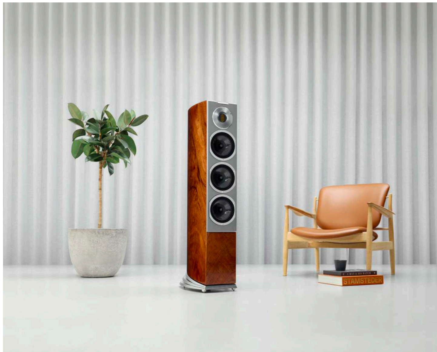
We use only carefully selected real wood veneers and offer a wide variety of custom finishes painted in Denmark.