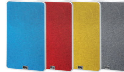
Cover grille fabric in different colors