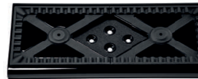
Base for Elegant BS 312.2