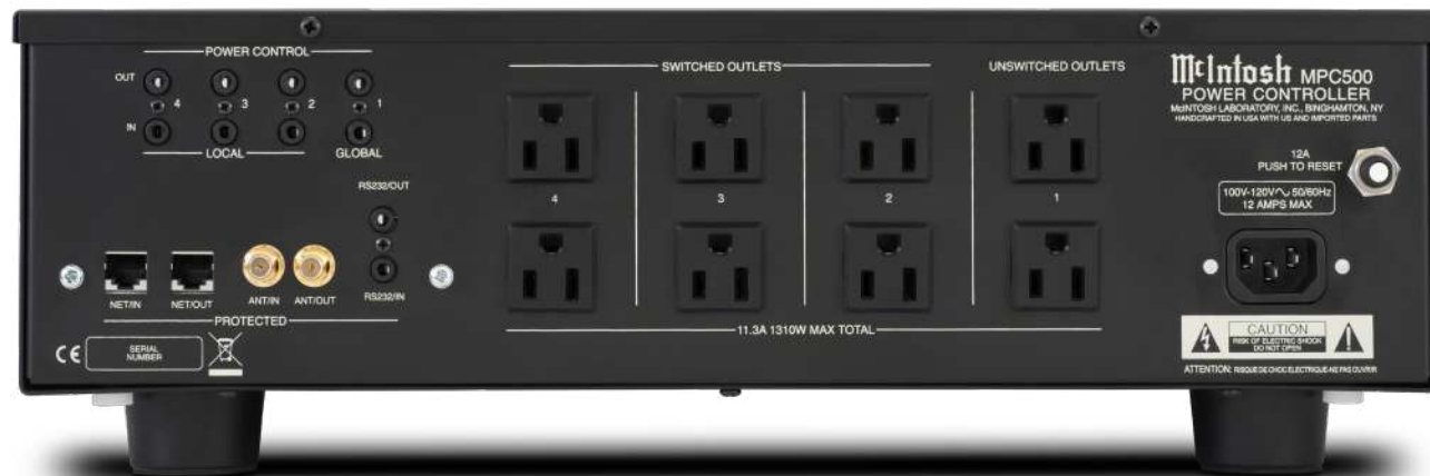
Top: MPC500 with Type B (a.k.a. NEMA 5-15R) receptacles. Bottom: MPC500 with Type F (a.k.a. CEE 7/3 or "Schuko") receptacles.

In order to ensure the highest level of customer satisfaction, new McIntosh products may only be purchased from an Authorized McIntosh Dealer; and, with certain limited exceptions may only be purchased over-the-counter or delivered and installed by the Authorized McIntosh Dealer. McIntosh does not warrant, in any way, products that are purchased from anyone who is not an Authorized McIntosh Dealer, or that have had their serial numbers altered or defaced.