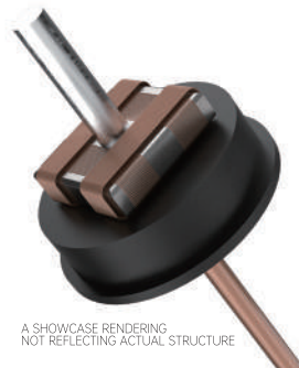
A SHOWCASE RENDERING NOT REFLECTING ACTUAL STRUCTURE