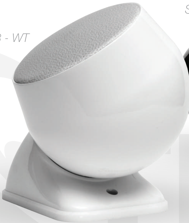
SAT3 - WT