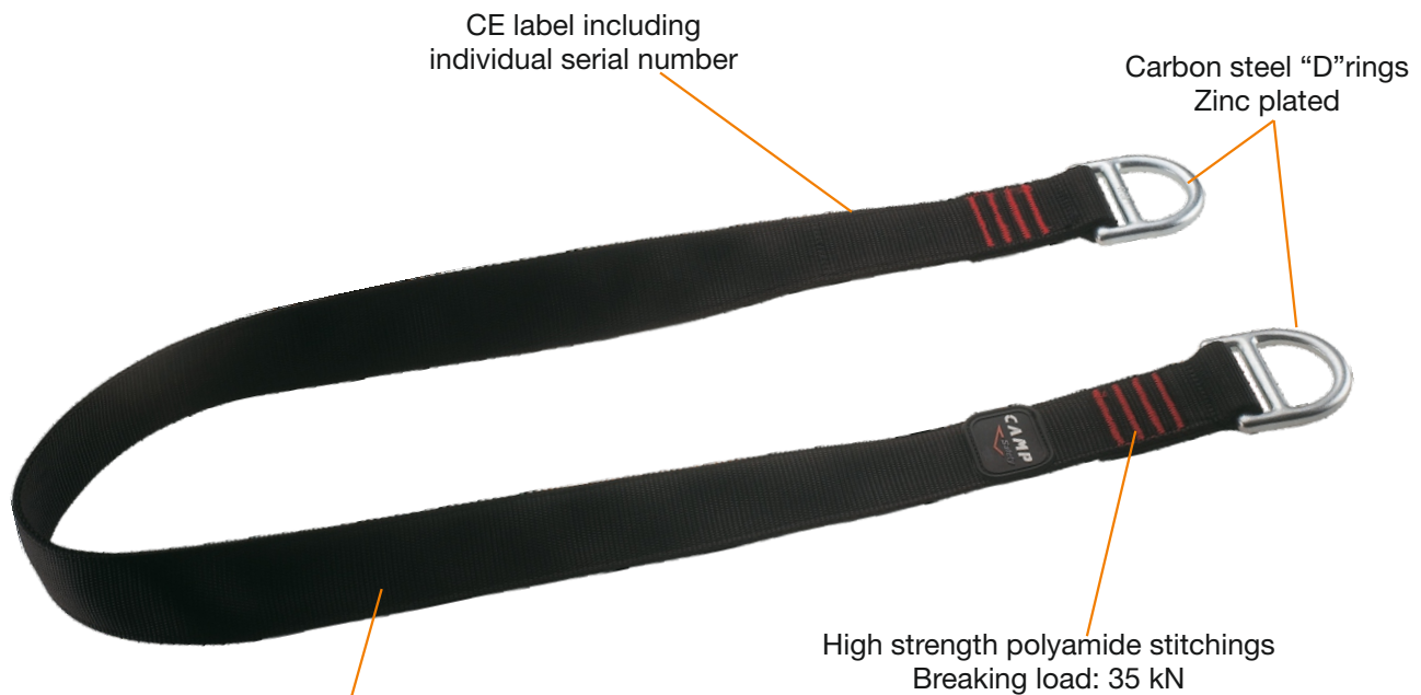
Example of a temporary anchor point

CONSTRUCTION ROPE ACCESS TOWERS/INDUSTRY