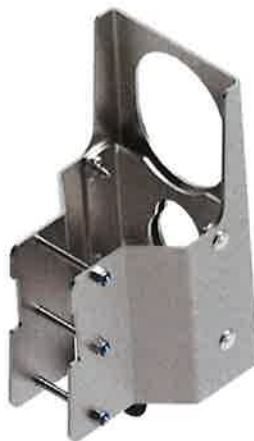
Fig. 3: Retaining bracket, type: retaining bracket IKAR 41-HRA 12E and retractable type fall arrester with rescue lifting device, type: IKAR HRA 12