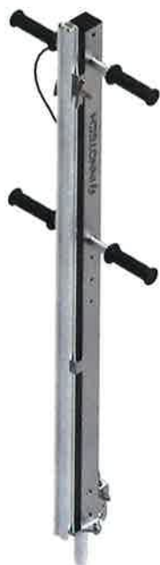
Fig. 2: Mounting bracket, type: TAURUS-SCE-10