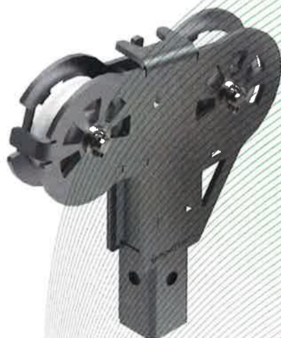
Fig. 4: Pulleys / Rescue attachment ZB