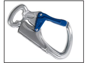
IKV 11 (EN 362:2004-T)