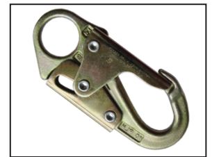
IKV 28 (ANSI Z.359.1-2007; CSA Z259.12-2011)