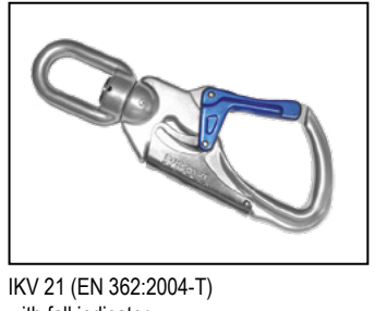
with fall indicator

IKAR retractable type fall arrester have been sucessfully tested in a simulated fall trial over and edge according to FprEN360:2022 ( r \ge 0.5 \text{ mm} ).