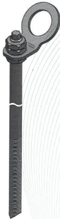
Fig. 1: Anchor device, type: POINT-15

In addition, the product, then labelled as AIO- POINT-15, is used as a component in the rope system of type INNOTECH ALLinONE.