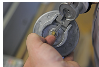
Removing the spent blank is simple

where the Launcher is aimed as this is no feeble machine, and is capable of propelling the dummy out to around 80-90yds. This is a lot of force, relatively, when you consider the size and weight of the projectile. To fire the dummy the handle is held with the outside of the fore arm facing towards the aiming zone (thumb will be facing towards your body at this point) so that the elbow will bend and safely take the recoil of the operation, then the striker at the bottom of the handle is pulled right back with the other hand and released to fire.