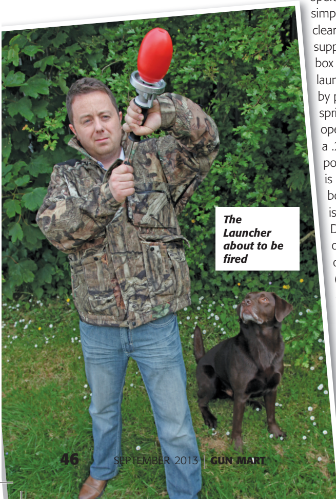
The Launcher about to be fired

the fully open position on the hinge. This allows you to remove the spent blank with your fingers easily, a nice little touch, simple but clever in design. This is quite an impressive piece of kit, demonstrating solid build quality, simplicity of use and dependable reliability after countless shots with easy maintenance procedures. Price of the Dummy Launcher and Red Dummy (supplied) is around £85, and an optional white canvas Dummy is available for about £21.75. This particular Launcher was supplied by The Skipton Gunroom in North Yorkshire (01756 792630 www.theskiptongunroom.co.uk ). For your local stockists contact John Rothery's Wholesale, who are the sole UK distributors, visit their website at www.bisley-uk.com