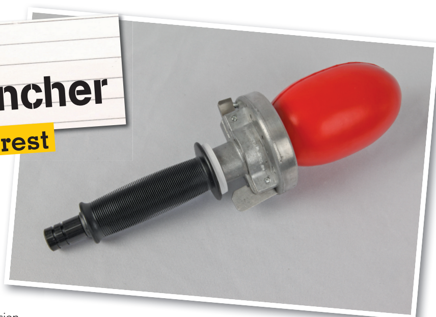
The Launcher complete with Dummy

With the Bisley Dummy launcher, operation is very simple and safe with clear instructions supplied in the box from new. The launcher is primed by pressing the spring catch to open the breech, a .22 cal high power 'Red' blank is placed into the bore, the breech is closed and the Dummy is slid over the "barrel" or cylinder (which makes an air tight seal with an O-ring). The Launcher is now primed and ready to fire. At this stage care should be taken as to