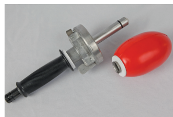
The barrel exposed without the dummy in place