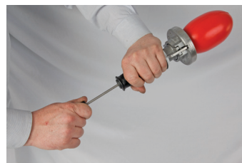
Drawing back the firing pin (Note how the launcher is held)