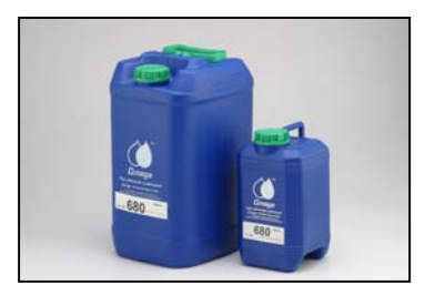
OMEGA 680 is available in 20 and 5 litre pack-sizes