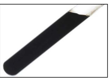
Black opaque color of OMEGA 680